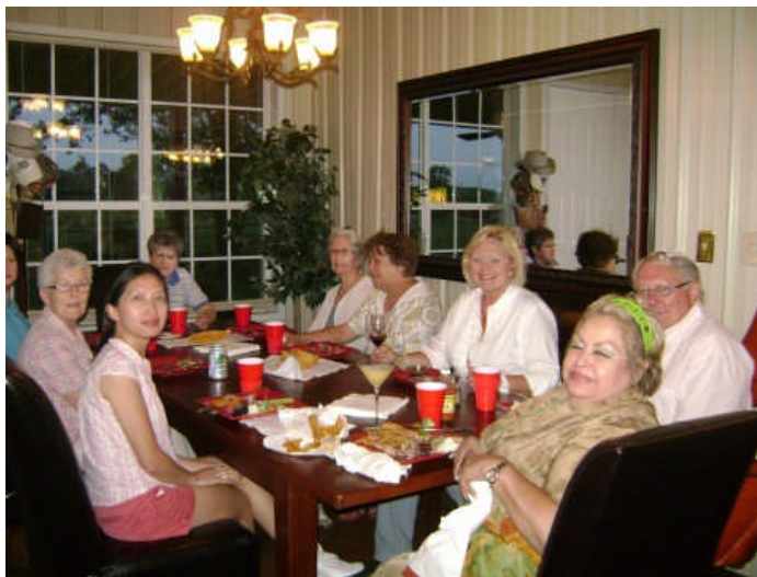
Houston Associates enjoy supper before beginning their planning meeting.

The Houston Associates are growing in membership and are transitioning to new leadership, so this retreat offered a good opportunity to pray and do some pre-planning for the coming year. This session will be followed up with a regular annual planning meeting August 27 at